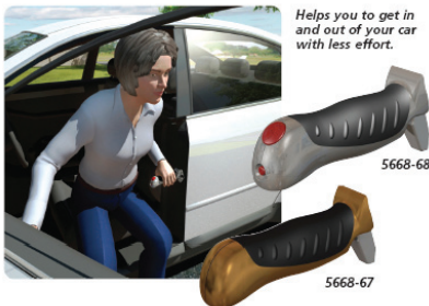
Helps you to get in and out of your car with less effort.

2. Weekly Pill Box: There are many kinds on the market but my clients prefer the weekly pill box that divides the pills into morning, noon, evening and bedtime and allows taking each day out individually. Filling it up once a week enables to see when you are running low on pills and reorder in plenty of time.